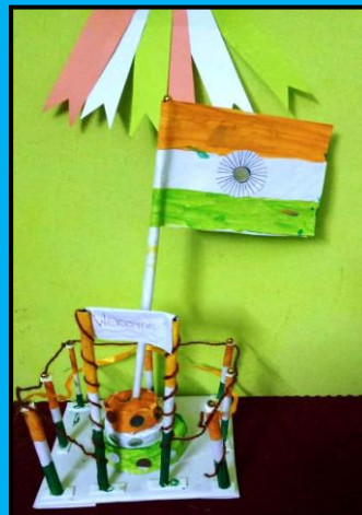
JOVISH DALLI, VIII-C