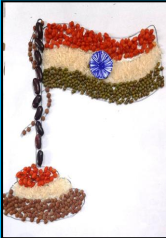
AADVIK ADITYA, I-C